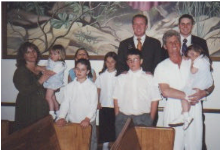
Elder's Hemming/Hicks Idaho Zone, Idaho