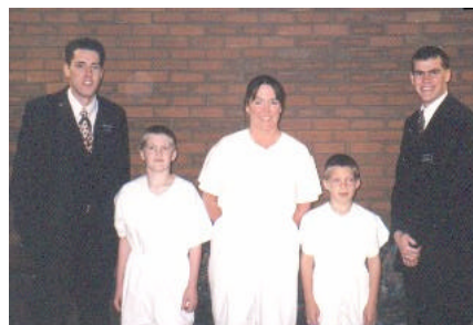
Elder's Davidson/Lowry Cache Valley Zone, Cache South