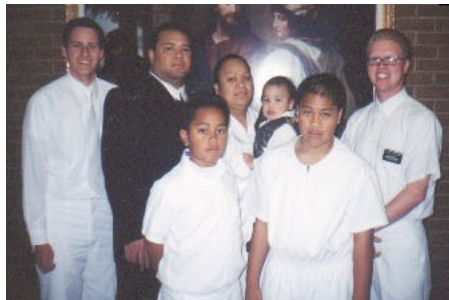
Elder's Brunner/Koopman Bountiful Zone, North Salt Lake