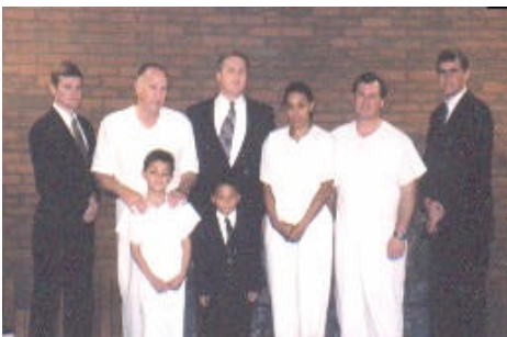
Elder's Lowry/Weller Cache Valley Zone, Cache South