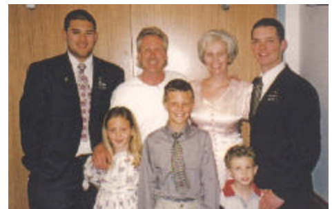
Elder's Albright/Miyake North Ogden Zone, Ogden Bay View